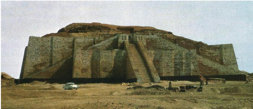
Rajah 1 / Figure 1