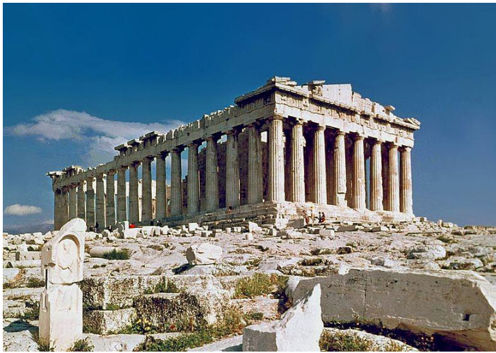
Rajah 2 / Figure 2